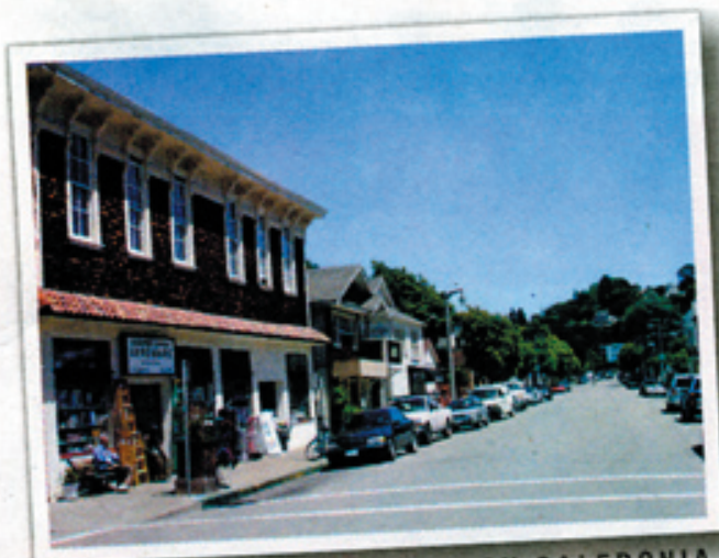
WATERSTREET HARDWARE ON CALEDONIA